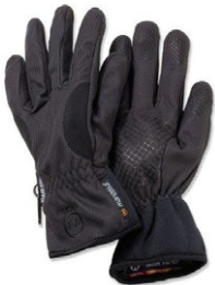
Manzella US7007B Silk Weight Windstopper Glove WSLU-10 Black ●