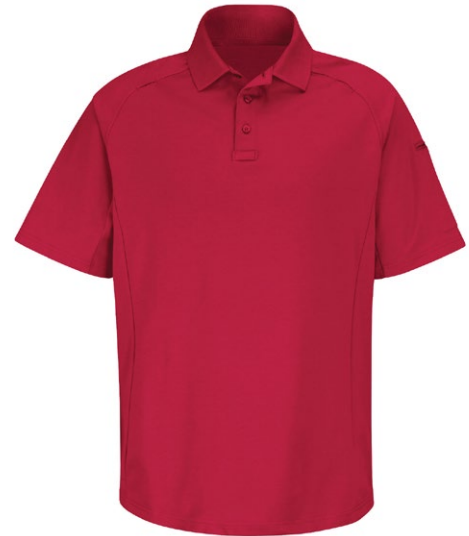
Horace Small HS5133 | HS5134 Special Ops Short Sleeve Polo Shirt

Blend: 63% Cotton/37% Polyester Sizes: XS – 4XL Stocked