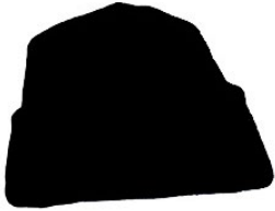
Wisconsin Knitting SF83BK Knit Winter Hat Black ●