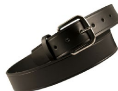
Boston Leather MD24BK 1 1/2" Leather Belt Sizes: 28 – 56 Stocked Black ●