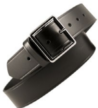
Boston Leather GV0008 1 3/4" Garrison Leather Belt with Silver Buckle Sizes: 28 – 54 Stocked Black ●