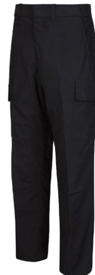
Horace Small HS2748 HS2746 | HS2750 Tactical Pant

Blend: 65% Polyester/35% Cotton Sizes: 28 – 66 Stocked