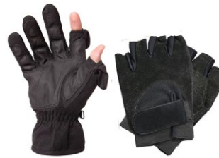
Worldwide Protective US7064B | US7065B Fold Back Fingers | Fingerless Fleece Gloves Black ●