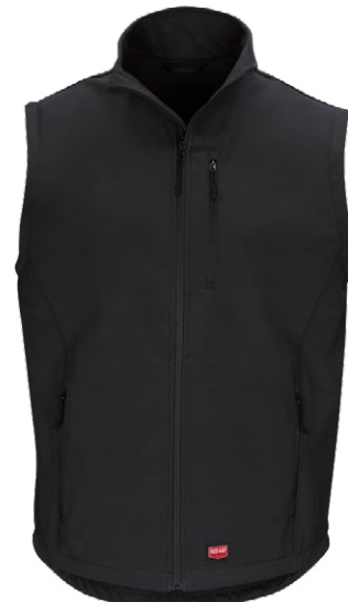
Red Kap VP62BK Soft Shell Vest Blend: 96% Polyester/4% Spandex Elastane