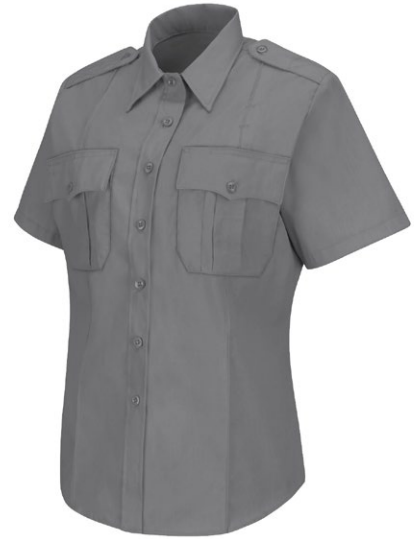
Horace Small HS1267

New Dimension® Poplin Short Sleeve Shirt