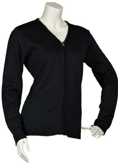
Cobmex US5737B V-Neck Zip Cardigan