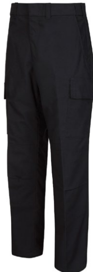
Horace Small HS2745 HS2747 | HS2749 Tactical Pant

Blend: 65% Polyester/35% Cotton Sizes: 4 – 24 Stocked