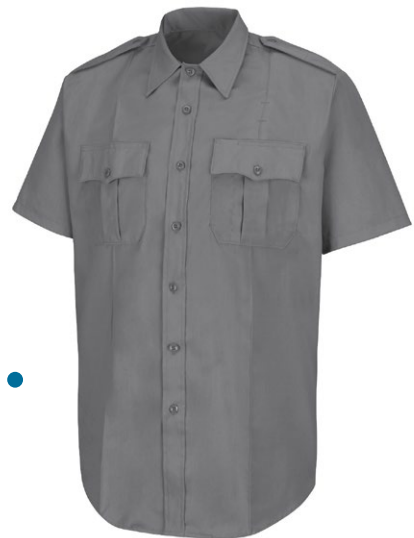
Horace Small HS1209

New Dimension® Poplin Short Sleeve Shirt