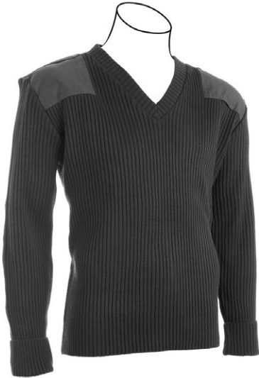
Cobmex US3223B V-Neck Commando Ribbed Knit Sweater