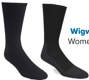
Wigwam CO6002 | CO6001 Women's | Men's Cool-Lite Pro Socks Black ●