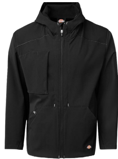
Dickies PH10BK Protect Hooded Jacket Blend: 92% Polyester / 8% Spandex Elastane