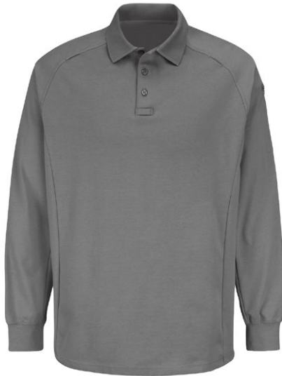
Horace Small HS5135 | HS5136 Special Ops Long Sleeve Polo Shirt

Blend: 63% Cotton/37% Polyester Sizes: XS – 4XL Stocked