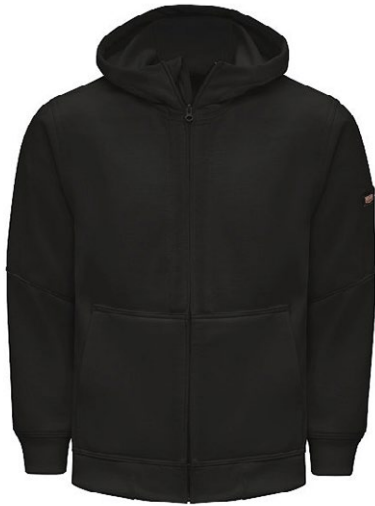
Red Kap HJ10BK Performance Work Hoodie Blend: 100% Polyester