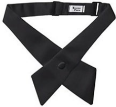
Samuel Broome US7063 | CO7117 Crossover Bow Black ●