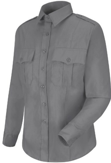
Horace Small HS1166