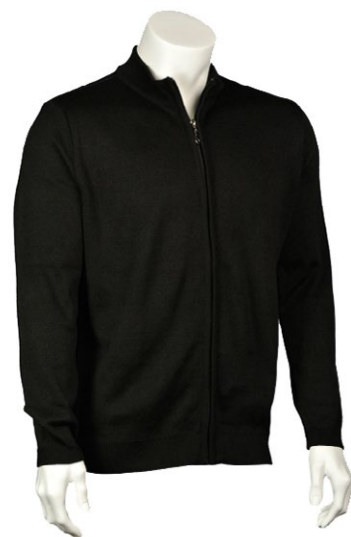
Cobmex US5739B Mockneck Full Zip Cardigan