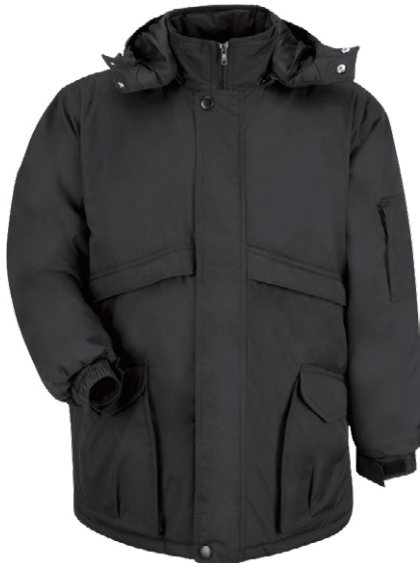
Red Kap JP70BK Heavyweight Parka Blend: 65% Polyester / 35% Cotton