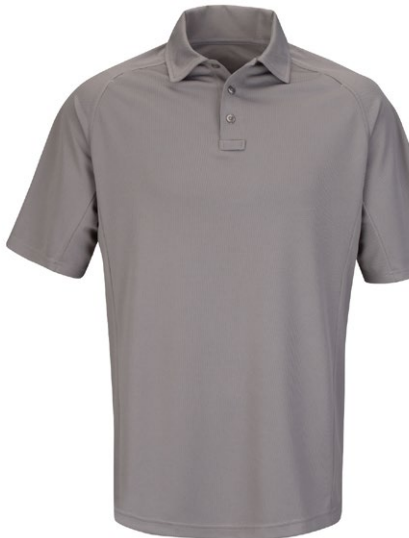
Horace Small HS5139 Sentry® Performance Tactical Polo Shirt

Blend: 100% Polyester Sizes: XS – 4XL Stocked