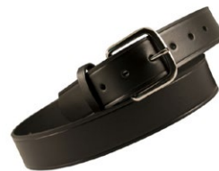
Boston Leather MD24BK 1 1/2" Leather Belt Sizes: 28 – 56 Stocked Black ●