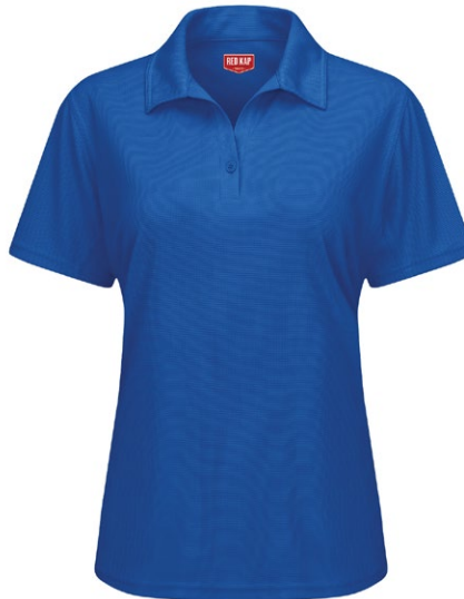
Red Kap SK91BK | SK91GY SK91RB SK90RD | SK91TN

Short Sleeve Performance Polo Shirt Blend: 100% Polyester; Sizes: XS – 3XL Stocked