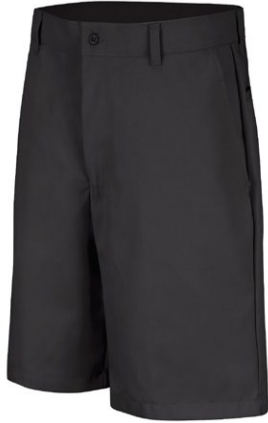
Red Kap PT26BK Uniform Shorts

Blend: 65% Polyester/35% Combed Cotton Sizes: 28 – 50 Stocked