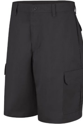
Red Kap PT66BK Cargo Shorts

Blend: 65% Polyester/35% Cotton Sizes: 30 – 50 Stocked