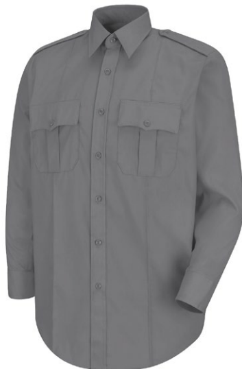
Horace Small HS1113