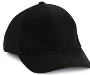
Red Kap HB20BK Brushed Twill Medium Profile Ball Cap Black ●