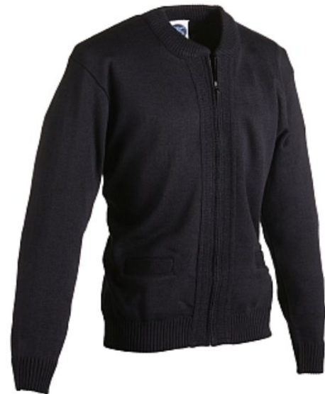
Cobmex US5735B Zip Front Cardigan with Seed Stitch Placket and Pockets