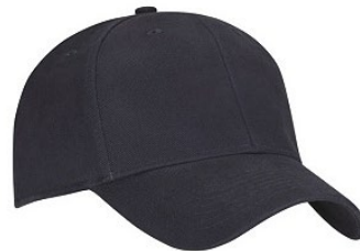
Headmost MD7011 Flex Fit Ball Cap Black ●