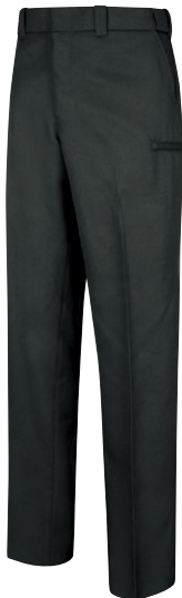
Horace Small HS2555

New Generation® Plus Hidden Cargo Pocket Pant