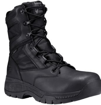
Timberland Pro T1167A Valor Duty Soft Toe Waterproof Side-zip