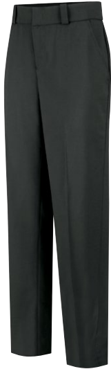
Horace Small HS2553