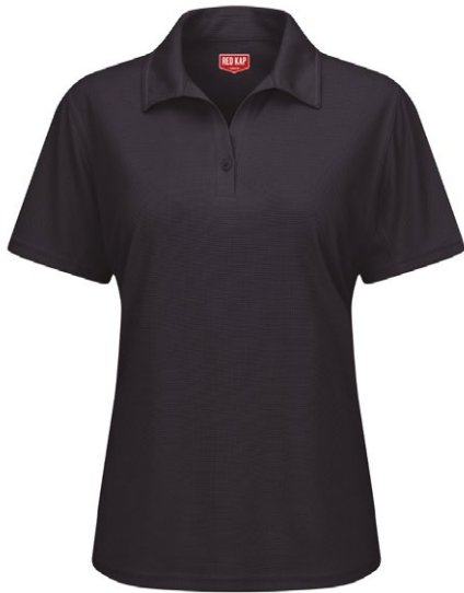
Red Kap SK91BK | SK91WH Performance® Knit Flex Series Polo

Blend: 100% Polyester Sizes: XS – 3XL Stocked