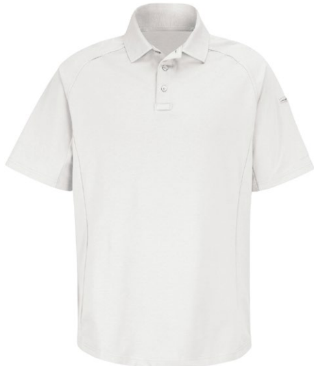
Horace Small HS5126 Special Ops Polo

Blend: 63% Cotton/37% Polyester Sizes: XS – 4XL Stocked