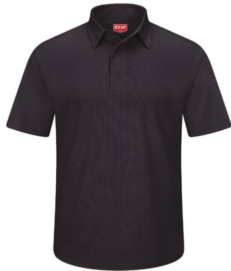
Red Kap SK90BK | SK90WH Performance® Knit Flex Series Polo

Blend: 100% Polyester Sizes: S – 6XL Stocked