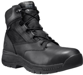
Timberland Pro T1164A Valor Duty Soft Toe Waterproof