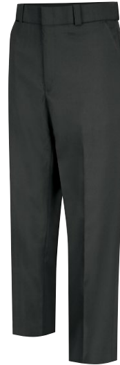
Horace Small HS2552