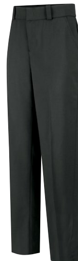
Horace Small HS2553 New Generation® Stretch 4-Pocket Pant

Blend: 74% Polyester/25% Wool/1% Lycra® Sizes: 4 – 24 Stocked