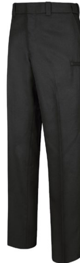
Horace Small HS2554

New Generation® Plus Hidden Cargo Pocket Pant